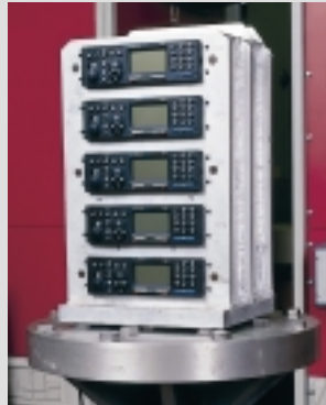
Blaupunkt Werke GmbH, Hildesheim

To keep you ahead of your competition in the next millennium, VibPilot is designed to put the products you test at the forefront of performance, durability and quality.