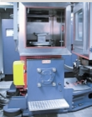
Siemens AG, Regensburg

m+p international Mess- und Rechnertechnik GmbH Freundallee 17 · 30173 Hannover · Germany Phone: (+49)-(0)5 11-8 56 03-0 Fax: (+49)-(0)5 11-8 56 03-10 E-mail: mpi@mpide.de